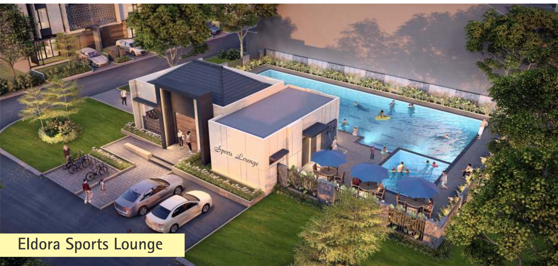
Eldora Sports Lounge