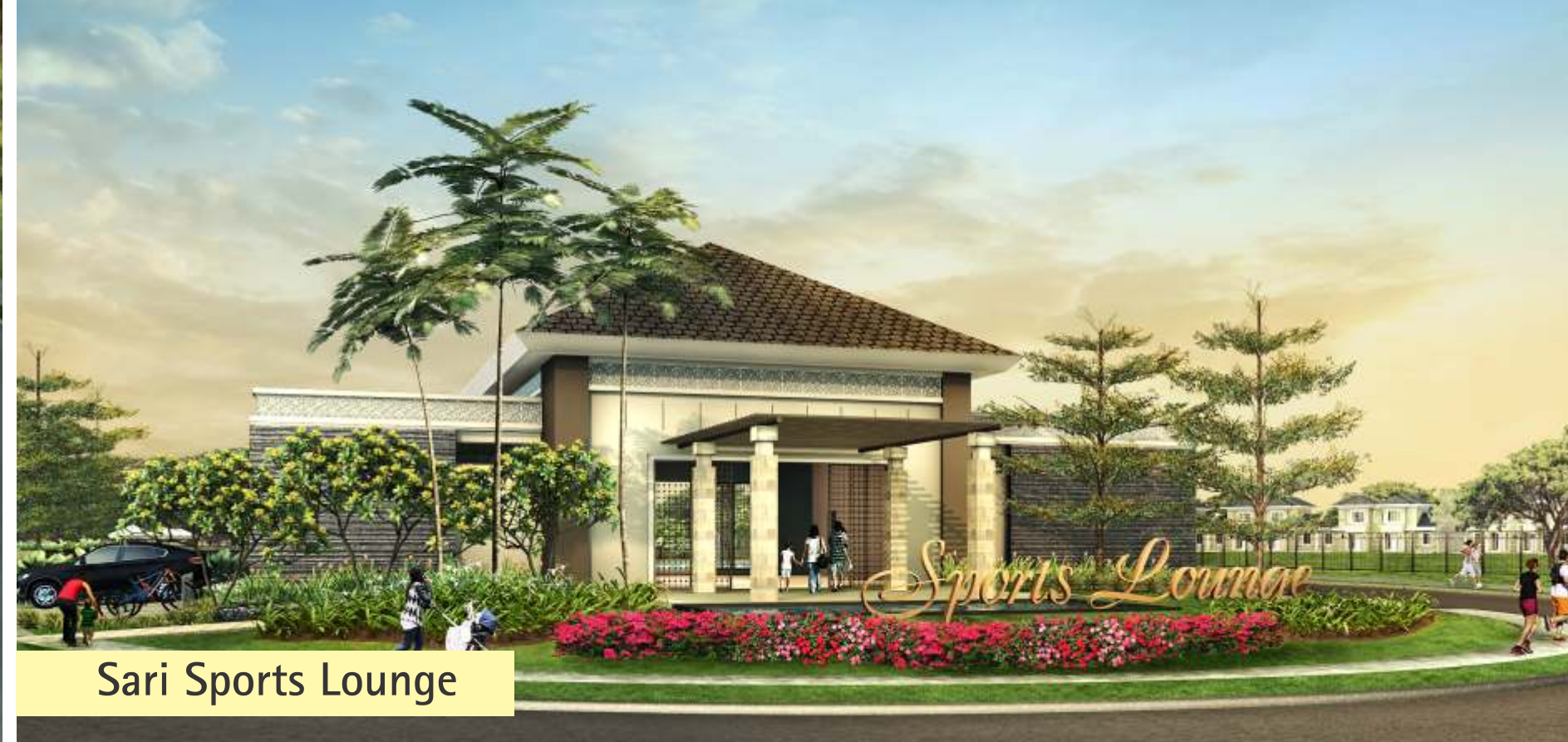
Sari Sports Lounge