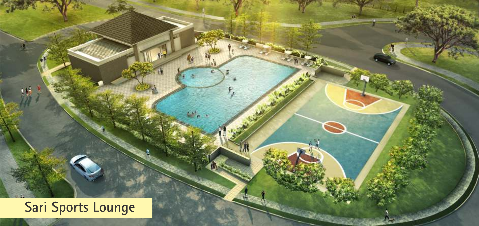
Sari Sports Lounge