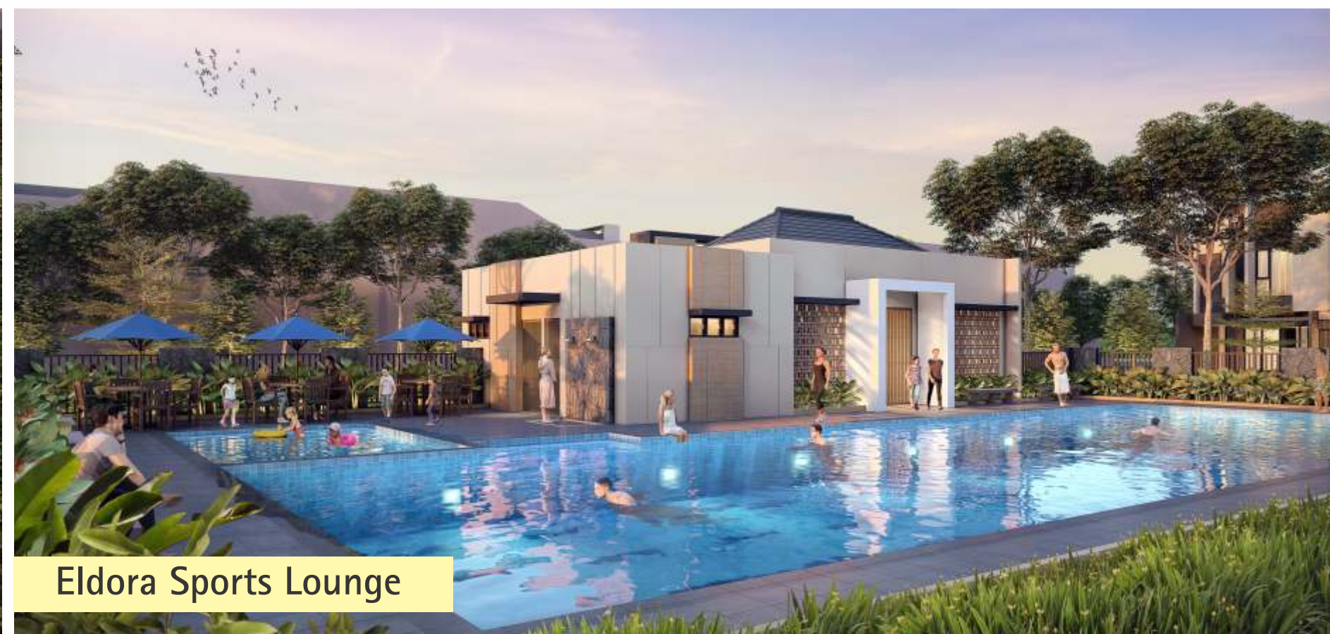
Eldora Sports Lounge