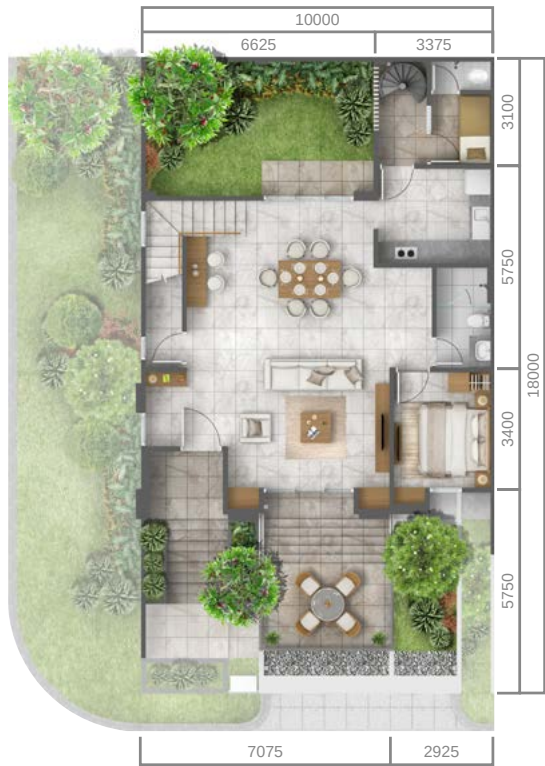
1 st floor