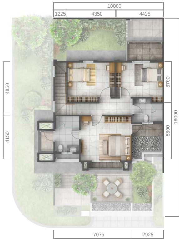
2 nd floor