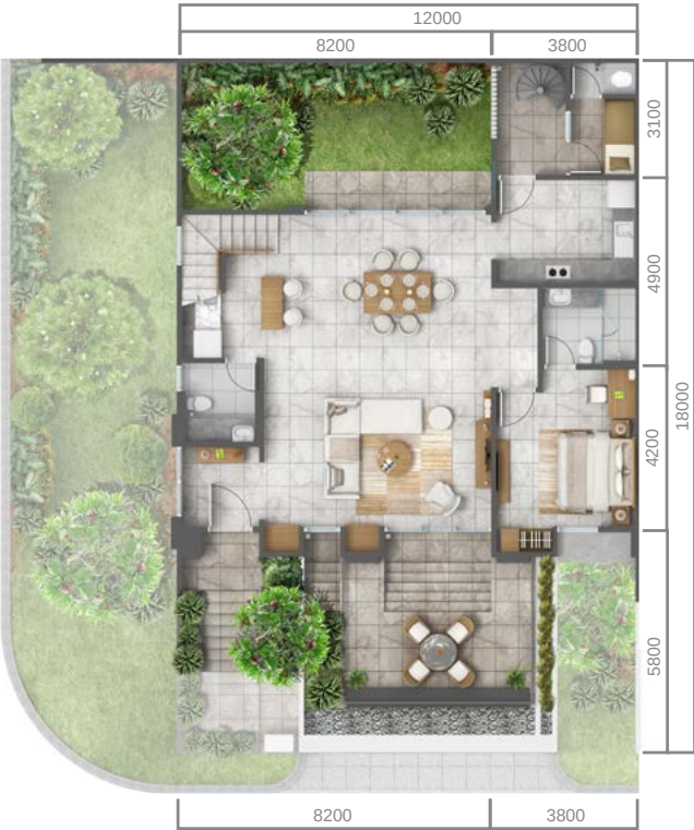
1 st floor