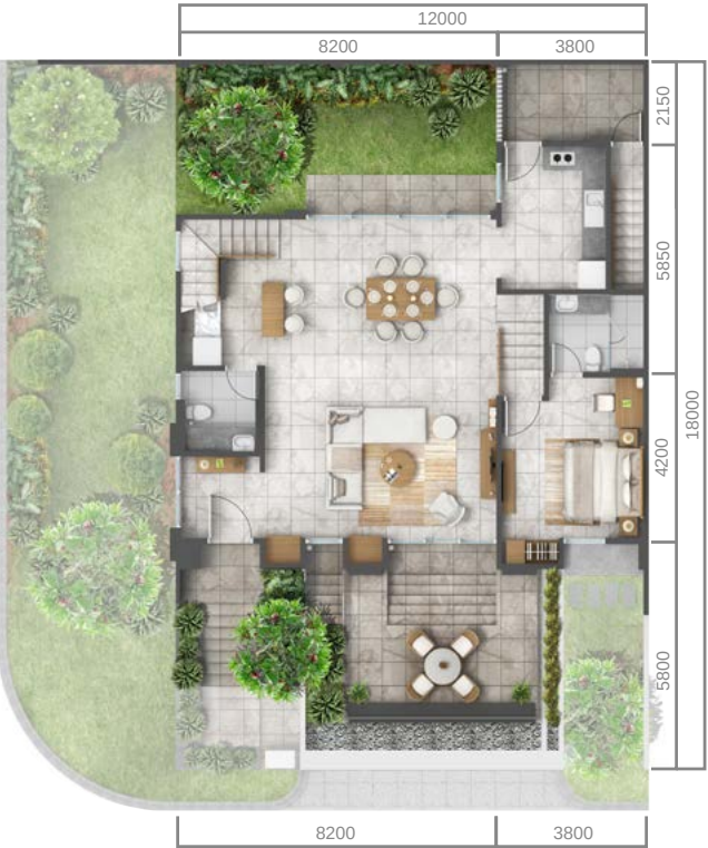
1 st floor