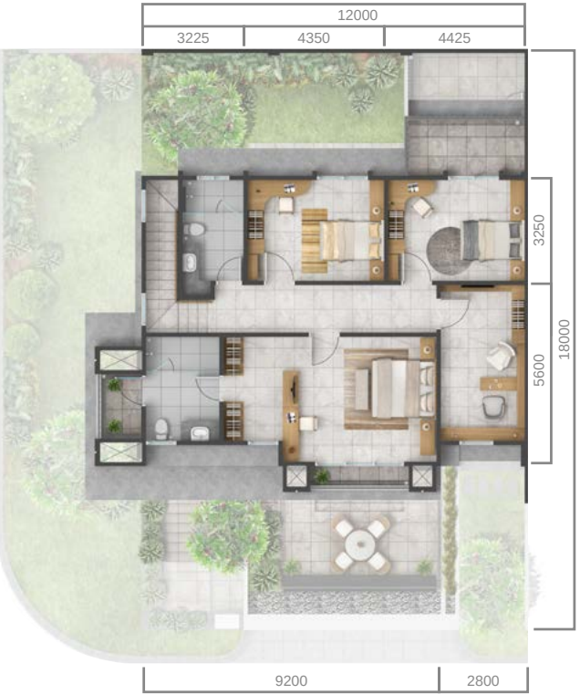
2 nd floor