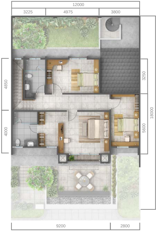
2 nd floor