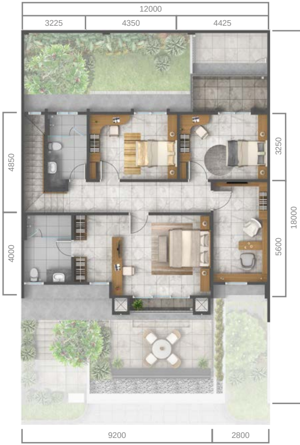
2 nd floor