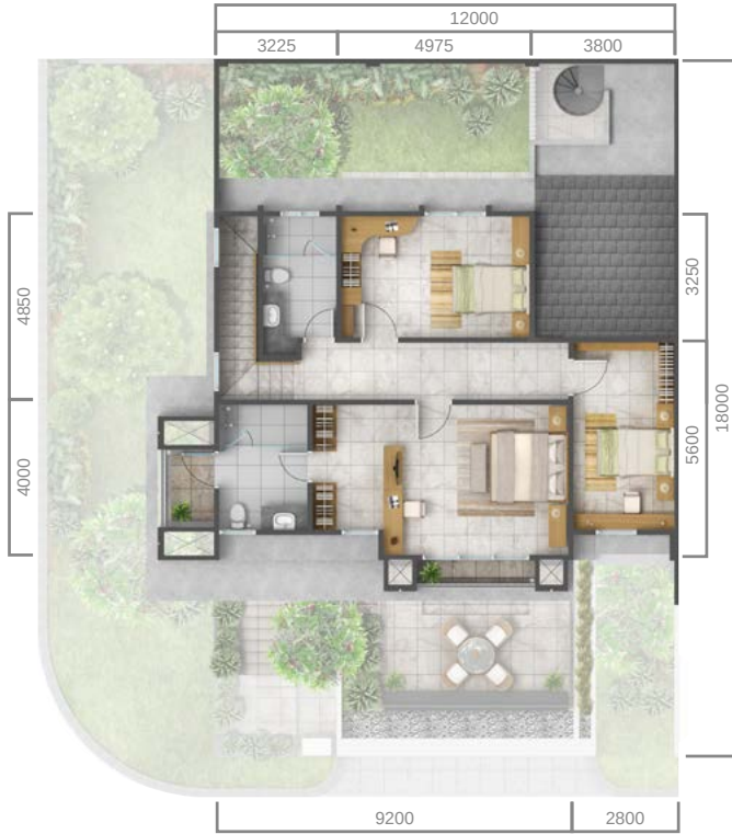
2 nd floor