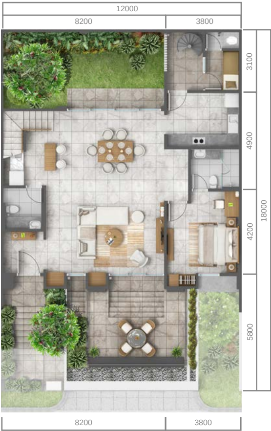
1 st floor